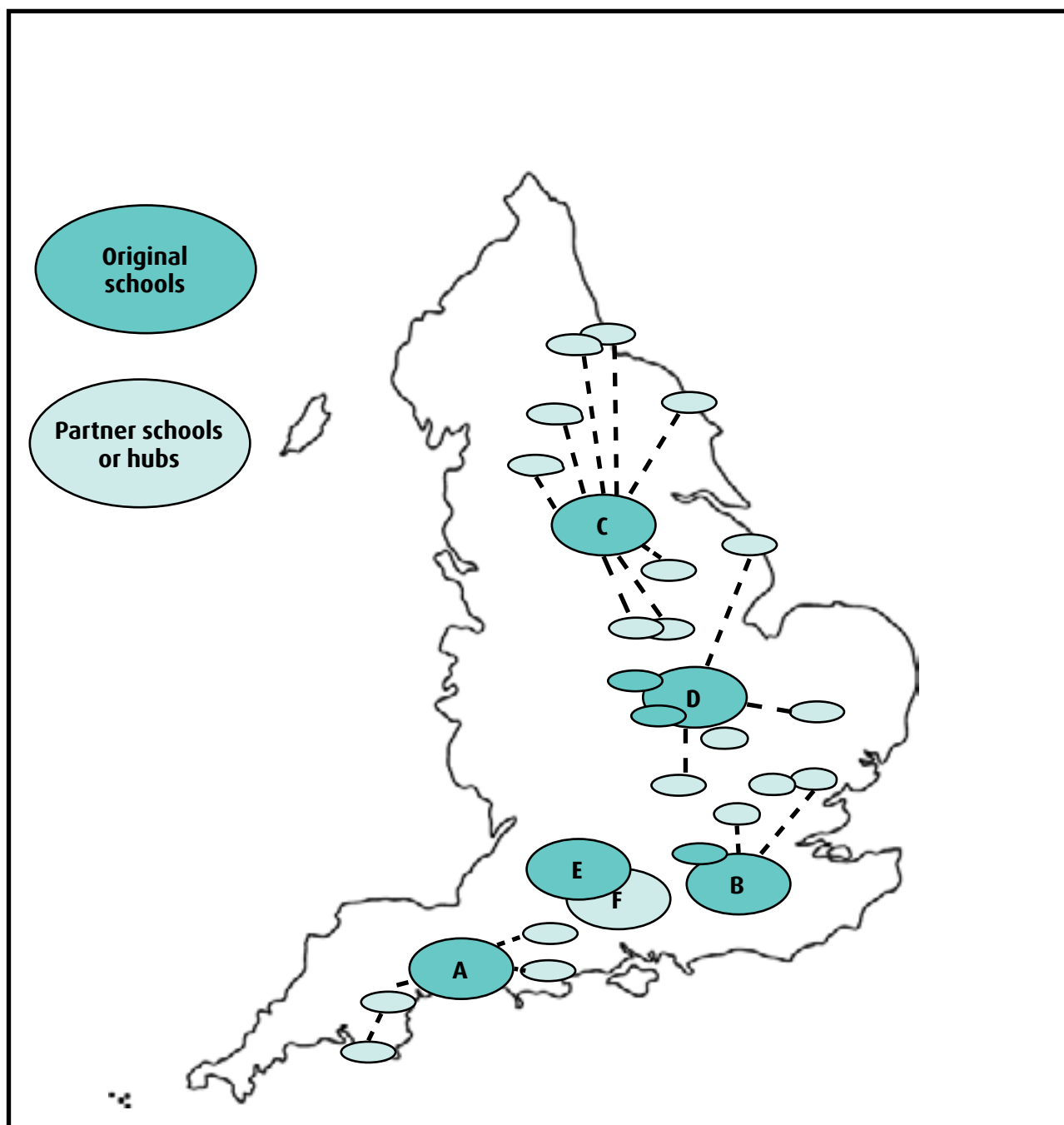
Figure 2: Growth of some illustrative school groups in the period 2008-11 (schematic)

The growth of chains brings new challenges in leadership development, especially where the chains assimilate schools with different operational cultures. The evolution of the Greenwood Dale Foundation Trust (group D in Figure 2) exhibits many of the principles of an organisation which, like most other existing chains, is on a journey towards an unfamiliar destination. Competent leadership at all levels is crucial to the effective functioning of the chain as it grows and changes form. The trust was initially formed from the governing body of Greenwood Dale School in Nottingham. The school, which serves a very challenging inner-city area, was judged to be 'outstanding' for the second time by Ofsted in 2007, having sustaining improvement from a very low base in the early 1990s (Ofsted, 2009). The headteacher took on wider system roles in the late 1990s/early 2000s with a seconded post to head school improvement in Walsall before returning to the school and becoming deeply immersed, with the school, in supporting several schools causing concern.